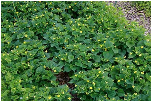
Downy Yellow Violet

Downy Yellow Violet Viola pubescens is also blooming now. This is a great little shade plant for spring blooms. It grows about 30 cm tall (12") and blooms throughout June. It has large heart shaped leaves. It grows as a clump but spreads by reseeding easily in moist soil.