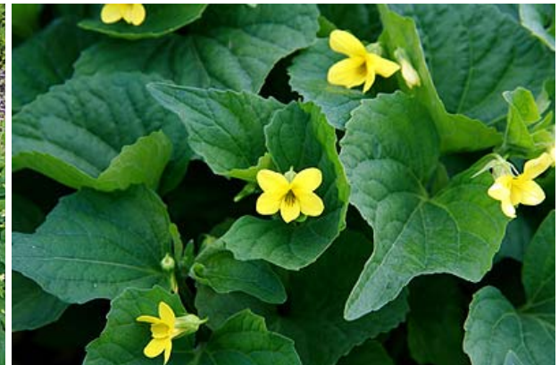
Downy Yellow Violet closeup

Also blooming now are Saskatoons, Hawthorn, Early Blue Violet, Northern Bog Violet, Western Canada Violet, Tall Bluebells, Star Flowered Solomon's Seal, Saline Shooting Star, Pussy Toes and Three Flowered Avens.