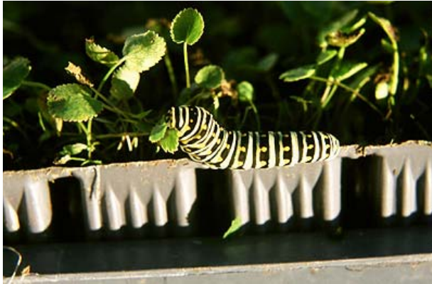
Black Swallowtail Caterpillar

They are excellent sources of pollen and nectar for many beneficial insects. They are members of the Carrot family which also includes parsley and dill. All these members of the Carrot family including Heartleaf and Golden Alexander are host plants for the Black Swallowtail butterfly caterpillars. So if you would like to attract these butterflies you need to have these plants in your garden.