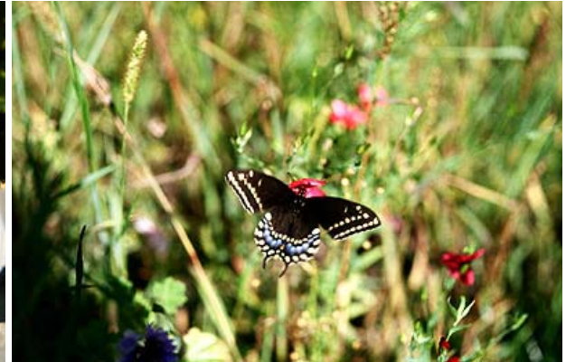
Black Swallowtail Butterfly

Both Alexanders are available in 5 packs of plugs and in 4.5" pots. Heartleaf Alexander is also available in seed packages.