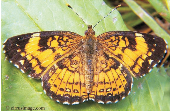
Pearl Crescent Butterfly

Great Spangled Fritillary Butterflies - There have been a fair number of these around this year. These large, showy butterflies over winter here. The eggs are laid on the food plant, which is violets, in late summer. Caterpillars hatch in late summer and fall. They grow a little bit and then enter a dormant phase to over winter at the base of the plant. In spring they begin feeding on the new foliage at night. The caterpillars are velvety black with orange based black spines.