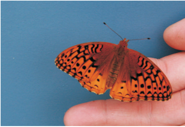
Great Spangled Fritillary Butterfly

Great Spangled Fritillary Butterflies - There have been a fair number of these around this year. These large, showy butterflies over winter here. The eggs are laid on the food plant, which is violets, in late summer. Caterpillars hatch in late summer and fall. They grow a little bit and then enter a dormant phase to over winter at the base of the plant. In spring they begin feeding on the new foliage at night. The caterpillars are velvety black with orange based black spines.