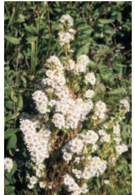
Many Flowered Aster