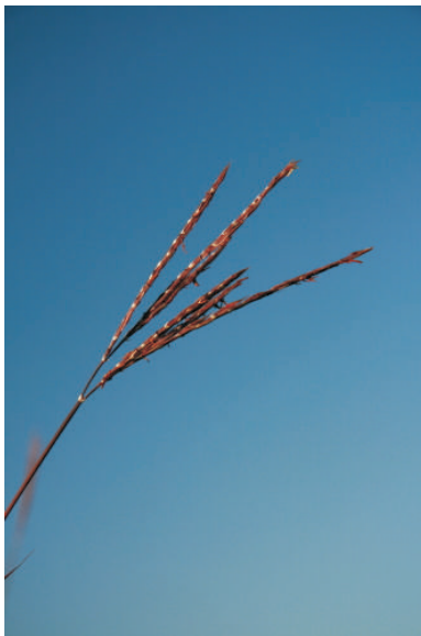
Big Bluestem seedhead