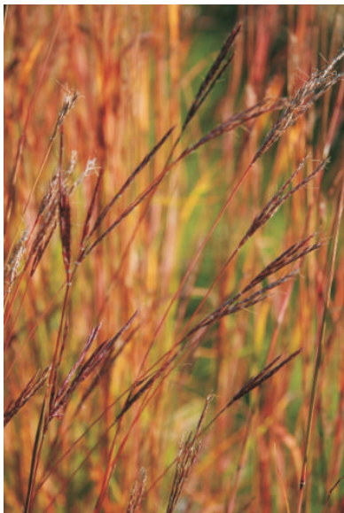
Big Bluestem fall colour

In addition to the Asters and Goldenrods, our warm season grasses look great at this time of year. The Big Bluestem is 5 to 6 feet tall. Imagine what it must have been like in the old days walking through the prairie in the Red River Valley with grasses up to your eyebrows or over your head!! Indian Grass is our other tall grass of the prairies at about 5 feet.