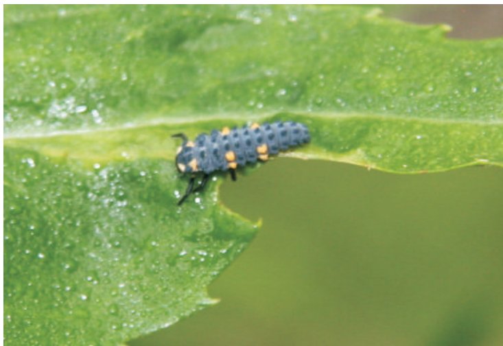
Alligator Ladybug larva

Ladybugs - Have you ever seen baby ladybugs? They are not just miniature versions of the adults. We had some show up this year to eat the aphids that appeared on the Obedient Plant. They look like little alligators. Ladybug larva will eat up to 400 aphids and adults will eat as many as 5,000 more aphids.