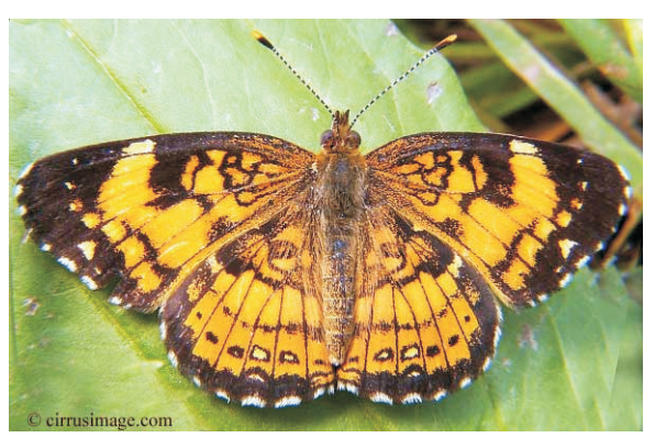
Pearl Crescent Butterfly

Great Spangled Fritillary Butterflies - There have been a fair number of these around this year. These large, showy butterflies over winter here. The eggs are laid on the food plant, which is violets, in late summer. Caterpillars hatch in late summer and fall. They grow a little bit and then enter a dormant phase to over winter at the base of the plant. In spring they begin feeding on the new foliage at night. The caterpillars are velvety black with orange based black spines.