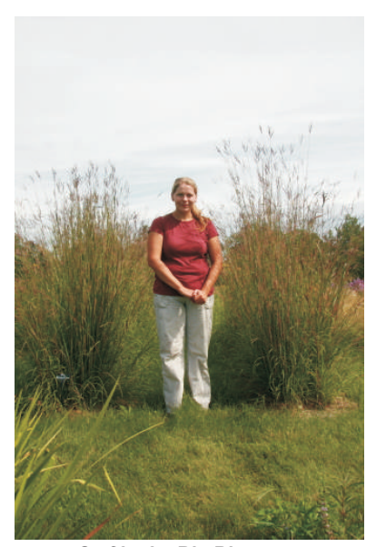
Big Bluestem fall colour