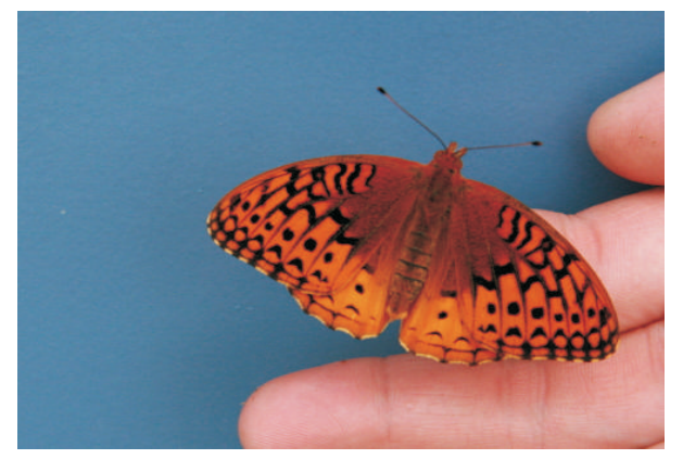
Great Spangled Fritillary Butterfly

Great Spangled Fritillary Butterflies - There have been a fair number of these around this year. These large, showy butterflies over winter here. The eggs are laid on the food plant, which is violets, in late summer. Caterpillars hatch in late summer and fall. They grow a little bit and then enter a dormant phase to over winter at the base of the plant. In spring they begin feeding on the new foliage at night. The caterpillars are velvety black with orange based black spines.