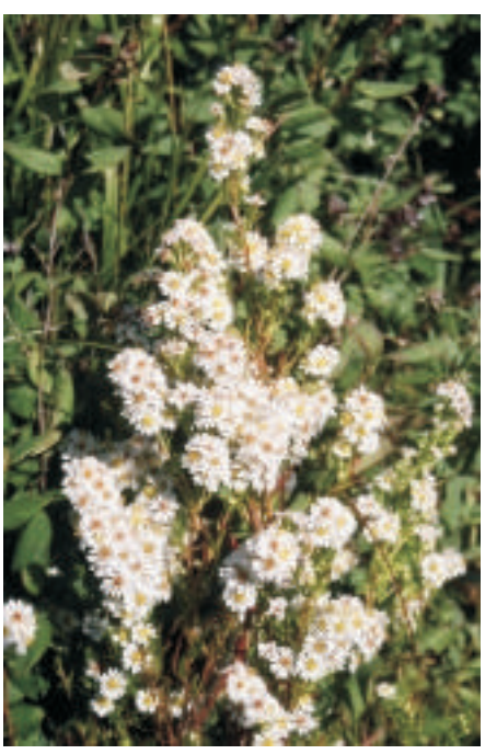
Many Flowered Aster